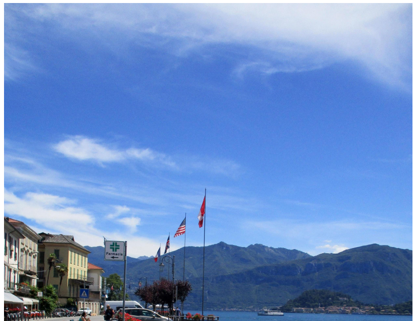
I chose 4 things: Chairs, Flowers, Face and Sky---these were the best shots out of all taken.